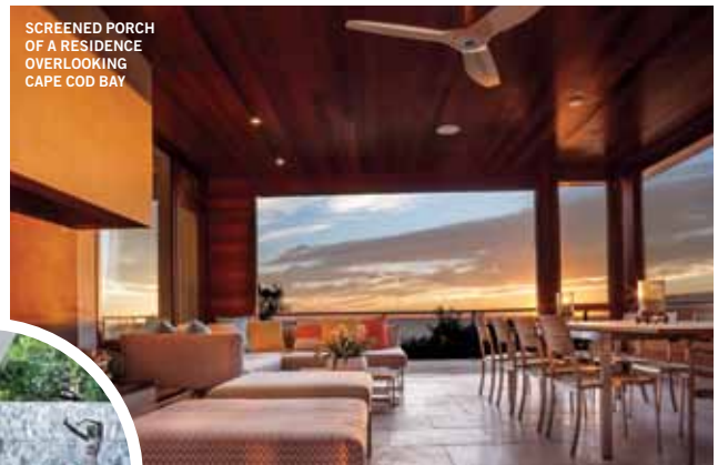
SCREENED PORCH OF A RESIDENCE OVERLOOKING CAPE COD BAY

"I was exposed to great modern architecture as a child. I grew up in a contemporary, architect-designed ranch house, and in summer I would visit my grandparents at their log cabin by a lake. I am visually and emotionally connected to a modern sentiment. Of course, Frank Lloyd Wright, being from Wisconsin, was a huge influence. I can look at anything he designed and be amazed, grateful to be an architect, and to be from Wisconsin."